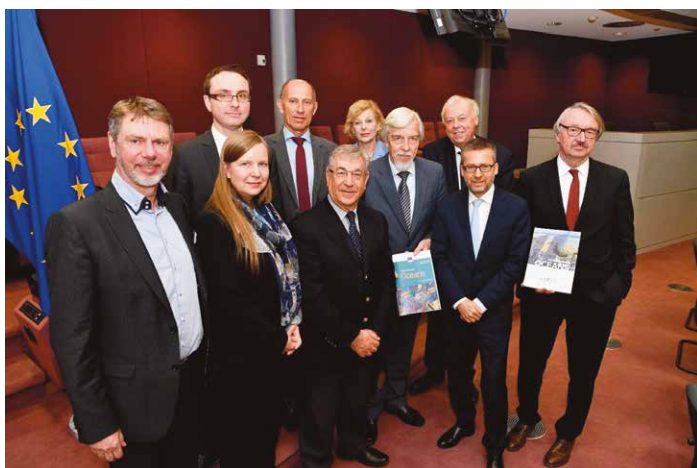
Handover of the SAPEA Evidence Review Report to the European Commission, November

The Food from the Oceans Evidence Review Report was delivered on-time and to-budget and was the first in the series to be published by SAPEA.