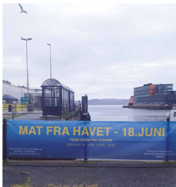
Mat fra havet – Food from the Oceans , Bergen, June

A highly innovative aspect of the SAPEA work has been public engagement activities for Food from the Oceans . These events provided the perfect opportunity for the Academia Europaea Hubs at Bergen and Cardiff to collaborate. The first, held in Bergen on 18th June, marked UNESCO Sustainable Gastronomy Day and Bergen's status as a UNESCO Creative City of Gastronomy. A series of colourful stalls offering food samples attracted around 2,000 visitors and featured on the main news of TV2, Norway's principal commercial channel, with up to 1 million viewers. A programme of public talks and an open debate on the theme of Food from the Oceans also took place.