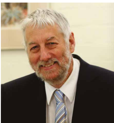
Professor Graham Hutchings FRS FLSW MAE (Cardiff University) was appointed to membership of the CCU (Carbon Capture and Utilisation) Working Group

All these new editorial approaches have been effective in driving up traffic to the Hub website. Between January and December 2017, there was an increase of 57% of online visits, compared to January-December 2016.