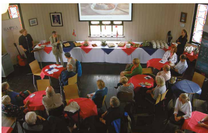
Reception to mark the 25th Anniversary of the restoration of the Norwegian Church in Cardiff Bay, July 2017

This open and free programme of events was the result of collaboration between the Cardiff and Bergen Hubs, together with SAPEA (Science Advice for Policy by European Academies). We also worked closely with other partners, including the SAM (Science Advice Mechanism) Unit, the Learned Society of Wales, the Hordaland County in Norway and Cardiff University. Especially popular was the Food from the Oceans stall, serving a variety of seafood from Norway and informing the public about SAPEA and the Food from the Oceans topic.