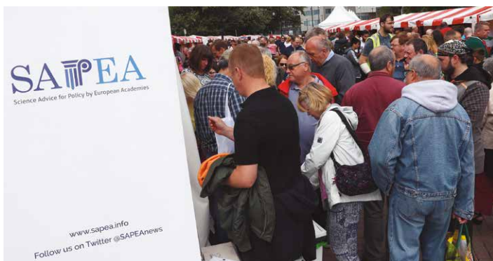
Crowds gather at the stall in Cardiff

The second event saw around 80,000 people come to Cardiff Bay over three days, 14th to 16th July, to enjoy the annual Cardiff International Food and Drink Festival. Food from the Oceans was the theme of a programme of events hosted at the Norwegian Church.