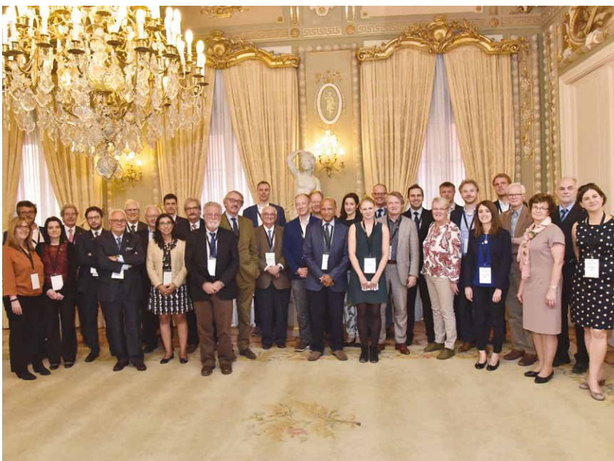
Royal Academy of Engineering, Madrid, September 2017