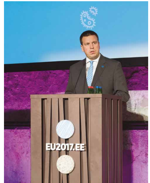
Prime Minister of Estonia, Jüri Ratas, addresses the Tallin conference