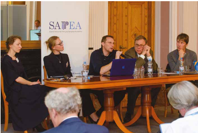
Panel discussion on public engagement at the Crossing Boundaries symposium