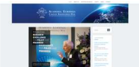
New Cardiff Hub website

The Academia Europaea Annual Meeting and Conference 2016 took place 26 th -30 th June in Cardiff, attracting a large international audience.