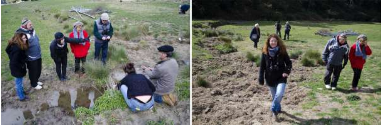
Excursion to the Natural Park of the Montnegre i el Corredor of the participants in the AE-BKH Women's Week 2016, on March 6th, 2016

On March 6, as the final act of the WW2016, and following a tradition of the AE's Annual Conferences, the speakers of the WW2016 made an excursion to the Natural Park of the Montnegre I el Corredor, about 35 km north of Barcelona. They explored the Mediterranean forest and visited sites of historical significance at the location.