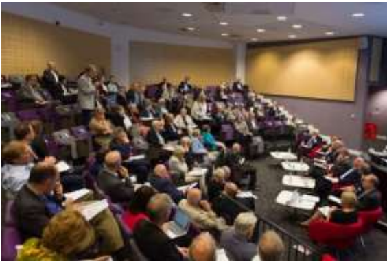
Academia Europaea Annual Conference 2016, Hadyn Ellis Building, Cardiff University

A new project, SAPEA (Science Advice for Policy by European Academies), kicked off in November. The Cardiff Hub is playing a major role in delivering work in the project, on behalf of Academia Europaea .