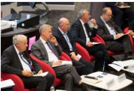
Panellists at the debate on Scientific Advice Mechanisms

The Erasmus Lecture, given by the UK's Astronomer Royal, Lord Rees of Ludlow, and entitled From Mars to the Multiverse .