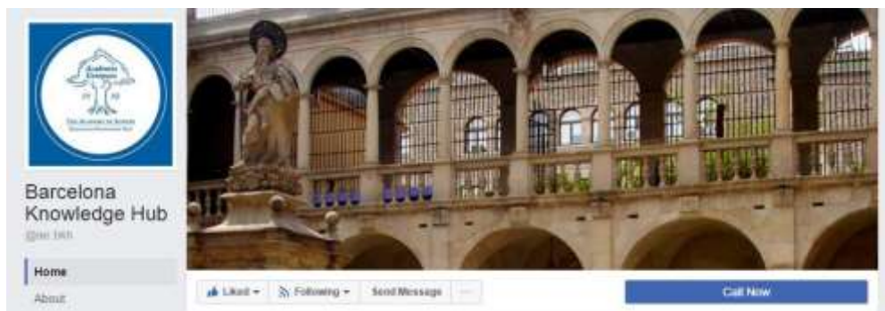
Frontpage of the AE-BKH Facebook page