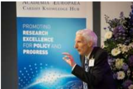
Erasmus Lecture 2016

The Erasmus Lecture, given by the UK's Astronomer Royal, Lord Rees of Ludlow, and entitled From Mars to the Multiverse .