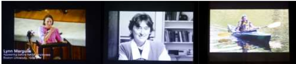
Lynn Margulis (1938–2011). Some stills from the film