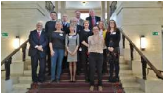
Joint Hub meeting in London

March - Representatives from all four Academia Europaea Hubs, together with the Young Academy of Europe, met in London to exchange progress reports and to coordinate planning in areas such as website development, marketing and communications.