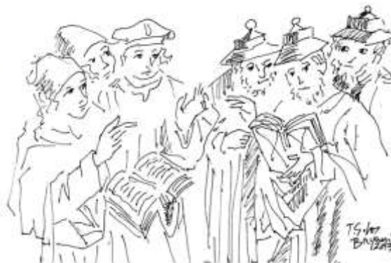
Left: Sant Jordi Gothic Hall of the Palau de la Generalitat. Right: The Disputatio of Barcelona, 1263.