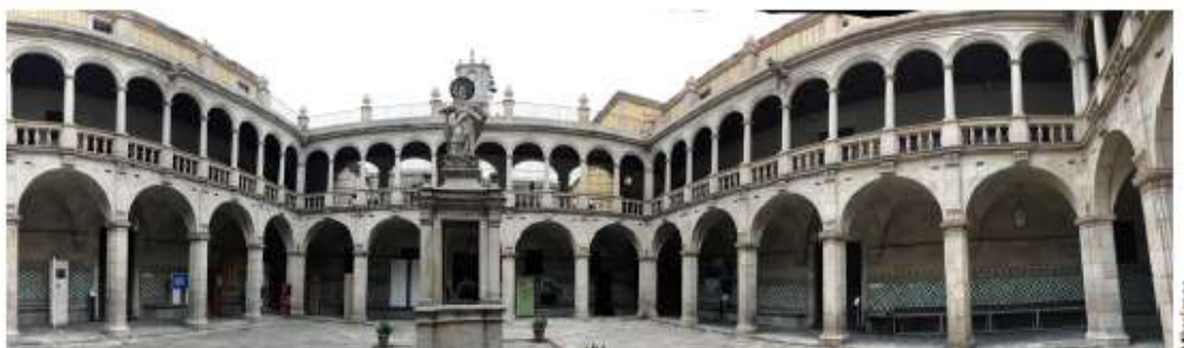
The Academia Europaea-Barcelona Knowledge Hub is located in the building of the Institute for Catalan Studies, in Barcelona.

ing of each argument on each side. The famous Disputatio of Barcelona , called in the summer of 1263 by King James I of Aragon and Catalonia, was the most important and well-known of the inter-faith Disputationes that took place between Christian and Jewish theologians in the late Middle Ages. In the Disputatio of Barcelona the disputantes were Friar Paulus Christianus, a Dominican (and a former rabbi converted from Judaism to Christianity) and rabbi Moshe ben Nachman (also known as Nahmanides), the most important scholar of Judaism at his time, from the Girona's community. The discussion focused on theological questions with the presence of the king and his court, and of the most significant men of Barcelona, then a prosperous and affluent city.