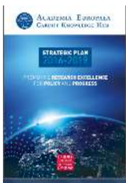
Front page of the Strategic Plan

The Hub's first Strategic Plan, covering 2016 to 2019, was professionally designed and printed. It was circulated to the Hub's wider stakeholder networks, including research-intensive universities in the UK and Republic of Ireland, national and regional academies across Europe, the Welsh government, European organisations such as the League of European Research Universities (LERU) and the European Universities Association (EUA).