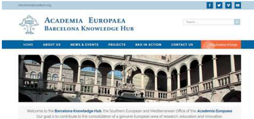
Frontpage of the AE-BKH website