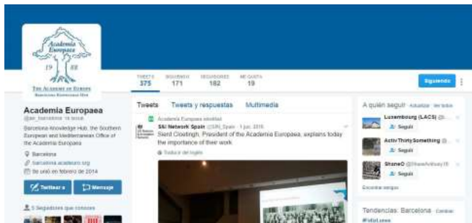
Frontpage of the AE-BKH Twitter profile