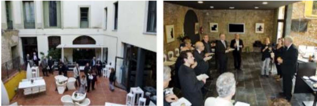
Lunch at the patio of the Petit Palace Boqueria Garden, located at the edge of the former Jewish Quarter of Barcelona

Afterwards, the attendants enjoyed a lunch at the restaurant of the Petit Palace Boqueria Garden Hotel, located in a 19th-century building at the heart of the city, and in the limits of the former Call . The president of the AE, Sierd Cloetingh, addressed a warm, friendly speech to the attendants.